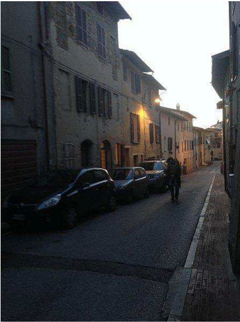
My beautiful love affair with Umbria – Sleepy town of Torgiano

Although the Etruscans have received more press, the Umbri settled in the region first, as far back as 1000 BC. In the 8 th c. BC Etruscans took over a large number of Umbrian settlements.