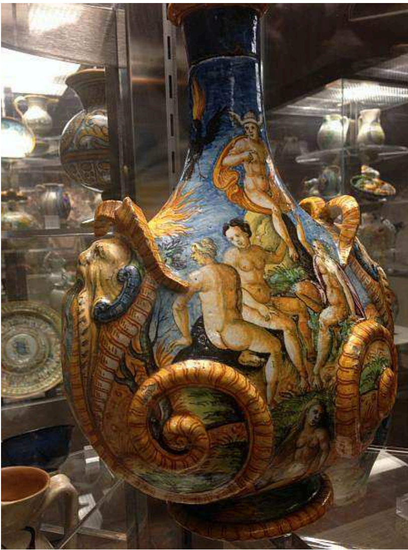
My beautiful love affair with Umbria – MUVIT Museo del Vino in Torgiano