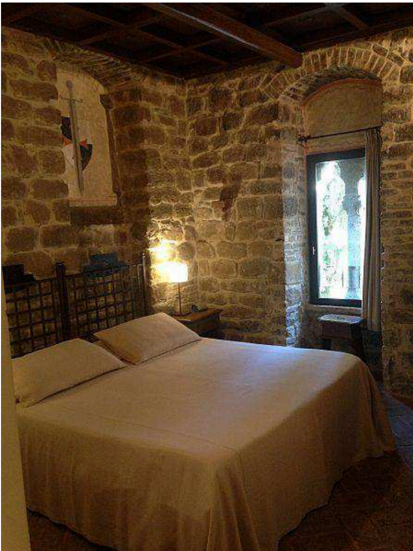
My beautiful love affair with Umbria – Castello di Monterone, bedroom

I fell in love with the hotel instantly and though technically not 5 star it has a lot of character, charm and tranquility.