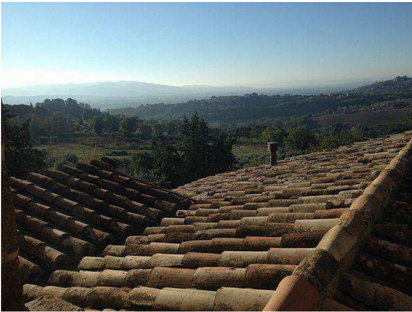
My beautiful love affair with Umbria – Castello di Monterone, looking over the rooftops on a sunny morning

I fell in love with the hotel instantly and though technically not 5 star it has a lot of character, charm and tranquility.